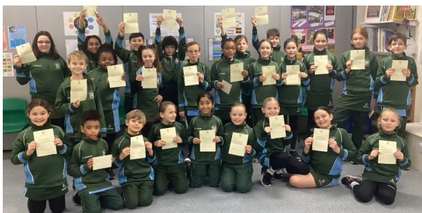
Illustration ECHO Club